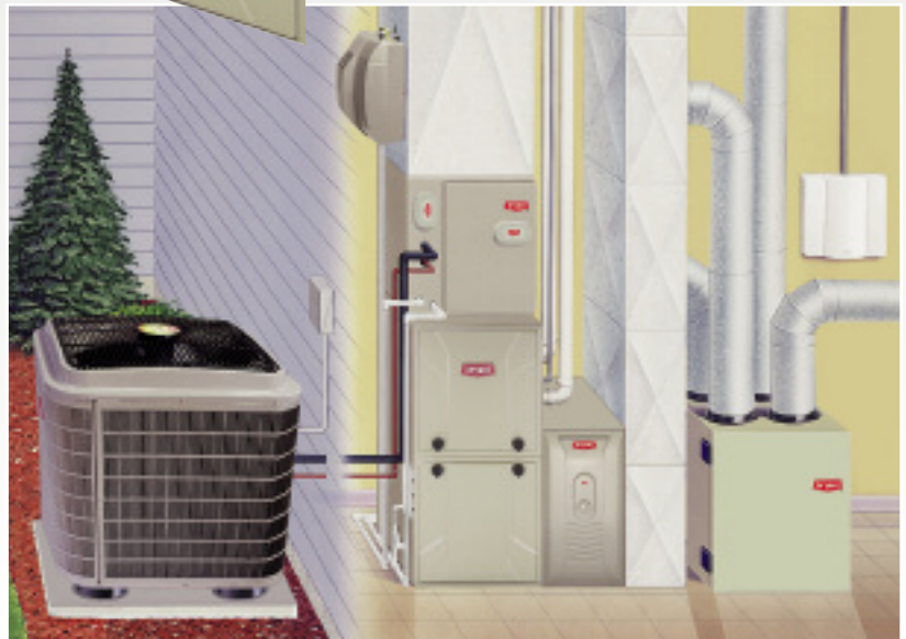
HYBRID HEAT® Deluxe Heat Pump and Deluxe Gas Furnace System